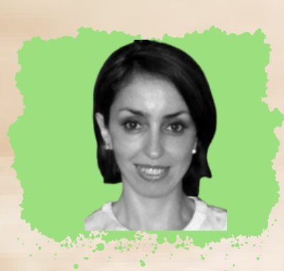
The Importance of Biodiversity Emergencies with a Multi-Scale Approach